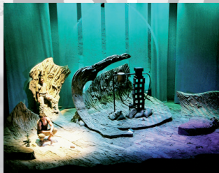
SAND Off-Broadway NYC 2008

Growing out of my considerable international treasure trove of experience as arts- / cultural teacher and designer for play, costumes and theatre sets, I always enjoy the challenge to recognize staging as empowerment for intercultural social skills and communication as a scope of action for people. My work translates narrative structures into adventurous, interactive, learning spaces. I am staging an emotional world for you!