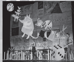
LEICHTERALS LUFT CH-Aarau 2014